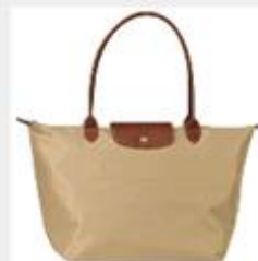
Longchamp Tasche Le Pliage Large Folding Tote Stiel Beige