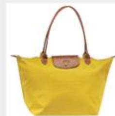
Longchamp Tasche Le Pliage Large Folding Tote Stiel Curry