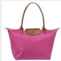
Longchamp Tasche Le Pliage Large Folding Tote Stiel Fuchsia