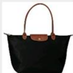
Longchamp Tasche Le Pliage Large Folding Tote Lange Griff schwarz