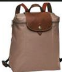
2013 Longchamp Outlet Le Pliage Rucksack Praline