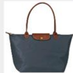
Longchamp Tasche Le Pliage Large Folding Tote Stiel Graphite