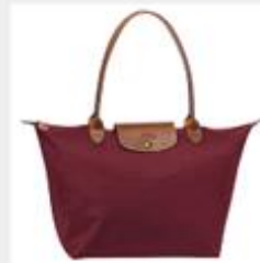
Longchamp Tasche Le Pliage Large Folding Tote Stiel Grape